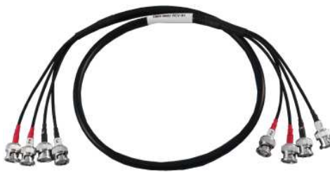
bnc-bnc Extender Cable, 1 m bnc-bnc Extender Cable, 2 m