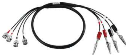
Alligator Clip Leads