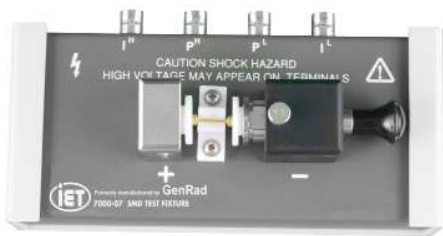
SMD Test Fixture