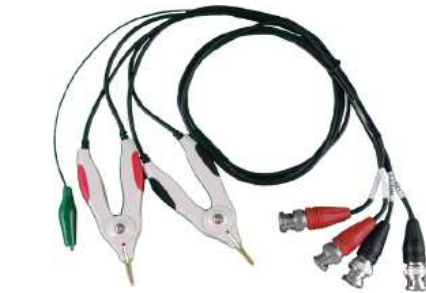
Kelvin Test Leads