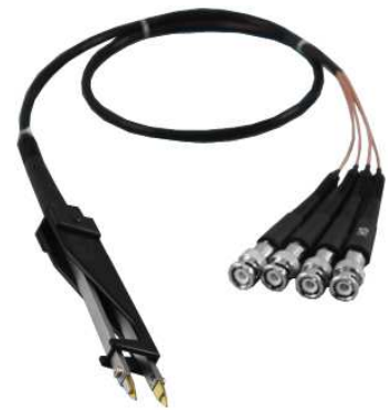
Chip Component Tweezers