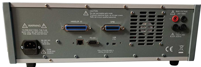
7660 Rear Connectors