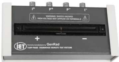
Remote Test Fixture